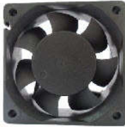
DC axial fan type AV-F2507

SIZE: 25x25x7mm CONSTRUCTION: Glass fiber reinforced thermoplastic Impeller and housing UL94V-0 OPERATING TEMPERATURE: Sleeve bearing -10C to +70C INSULATION RESISTANCE: >10 megohm at 500VDC (frame-terminal/wires) DIELECTRIC STRENGTH: 500V/60HZ, 5mA, 1 minute (frame-terminal/wires)